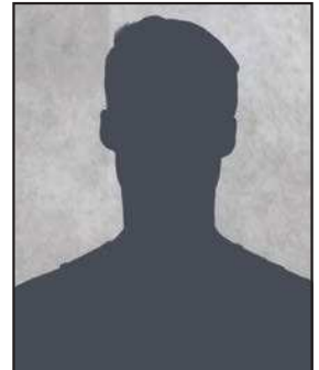
VACANT South Central Unit